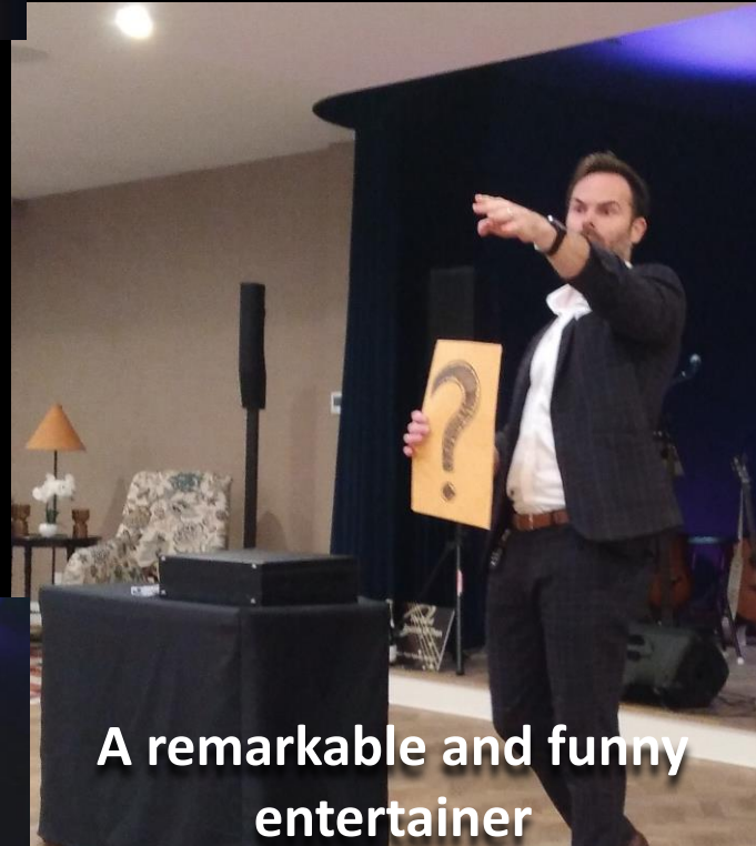
A remarkable and funny entertainer